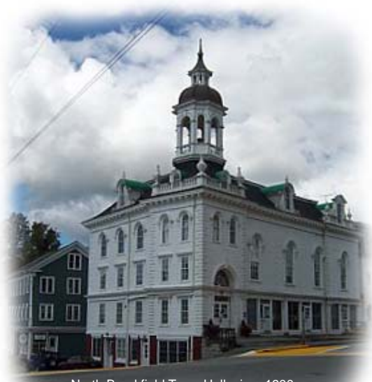
North Brookfield Town Hall, circa 1900