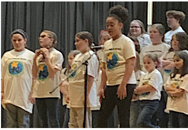
<- The ROAR Cool Kids were rocking again as they performed May 3 rd .