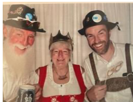
The Chipmunks German Band is returning!!