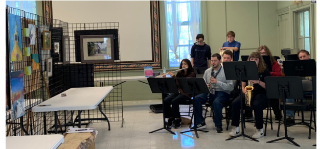
^ The NB High School band played at the Friends Art Show in the Congregational Church Hall.