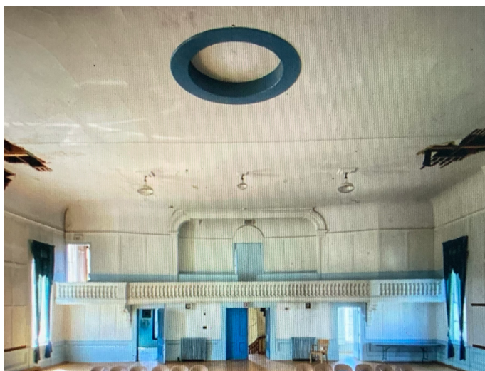
Balcony and Access to Storage Area in the Attic