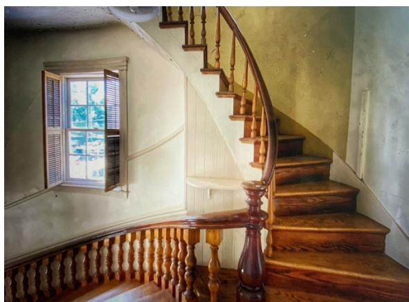
Stairway to the Balcony