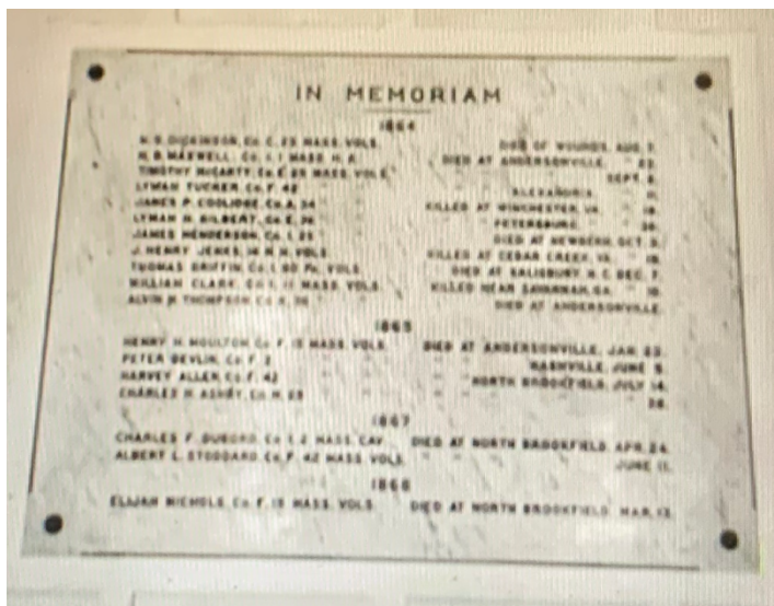
Civil War Commemorative Plaques